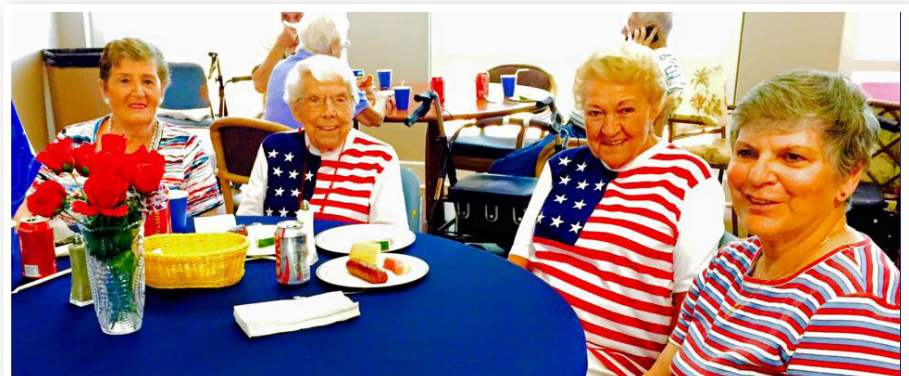
Memorial Day Luncheon