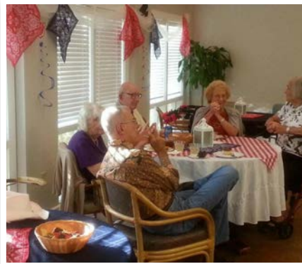
The residents had a good time at the Hoedown!