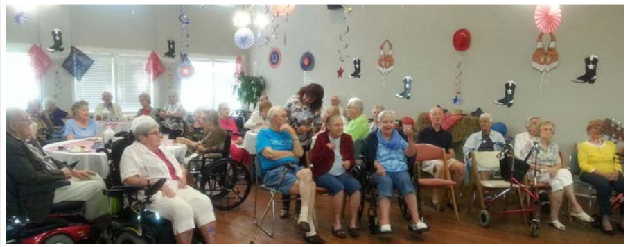
Memorial Day Luncheon