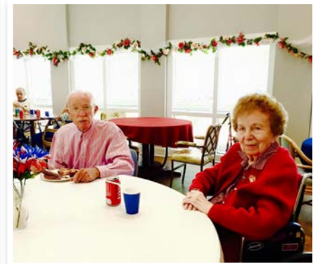
“I’ve had the time of my life ...”